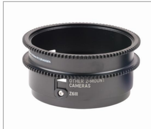
Z2470-Z Zoom Gear