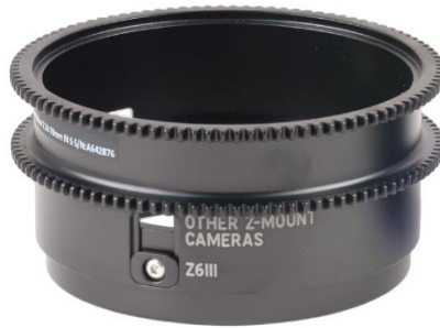
Z2470-Z Zoom Gear