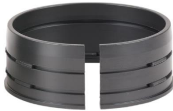
Plastic C-ring for Zoom Gear