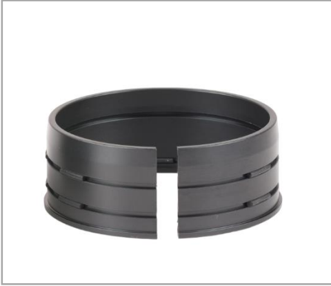
Plastic C-ring for Zoom Gear