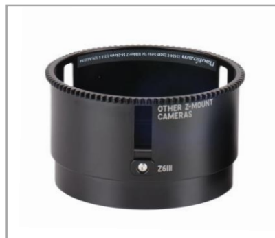
Z1424-Z Zoom Gear