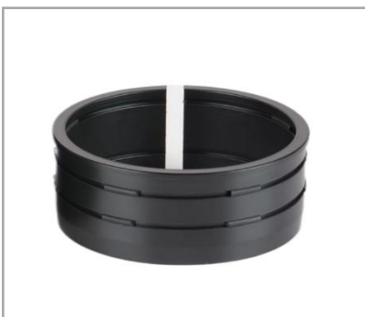
Plastic C-ring for Zoom Gear