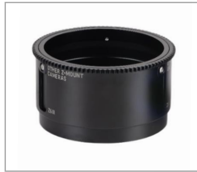
Z105-F Focus Gear