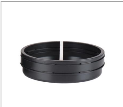
Plastic C-ring for Zoom Gear