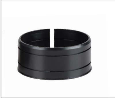
Plastic C-ring for Focus Gear