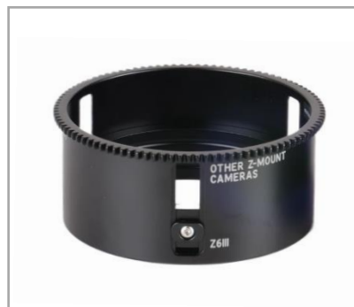
Z1430-Z Zoom Gear