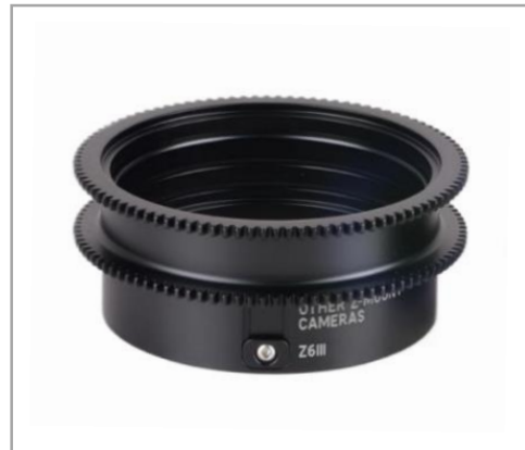
Z2450-Z Zoom Gear