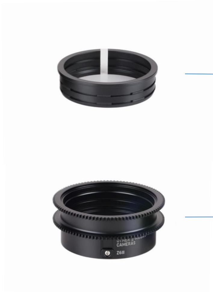
Plastic C-ring for Zoom Gear