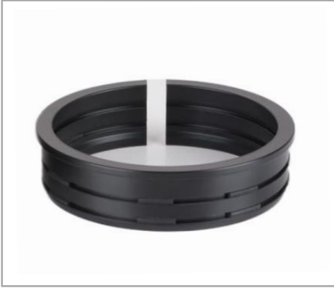
Plastic C-ring for Zoom Gear